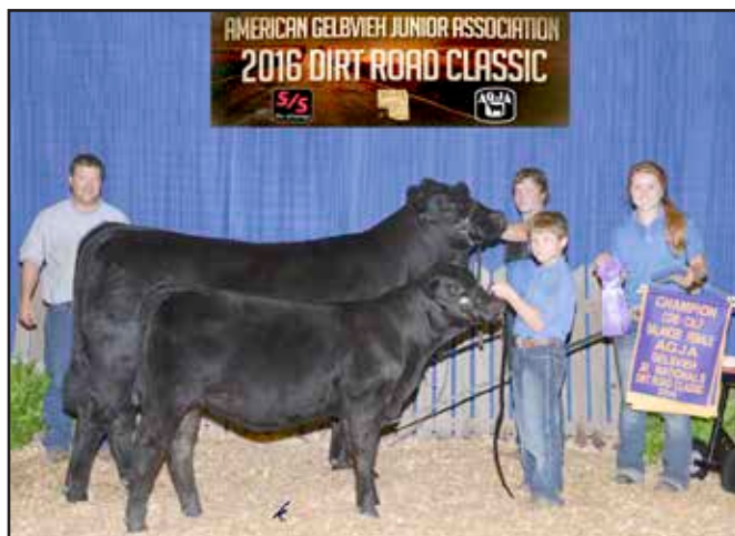
Reserve Supreme Balancer Female 2016 Gelbvieh Junior Nationals

A.I.'ed to JRI Multitool 706A22 on 5/21/2016