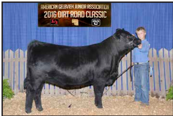
Reserve Division Female at Gelbvieh Junior Nationals