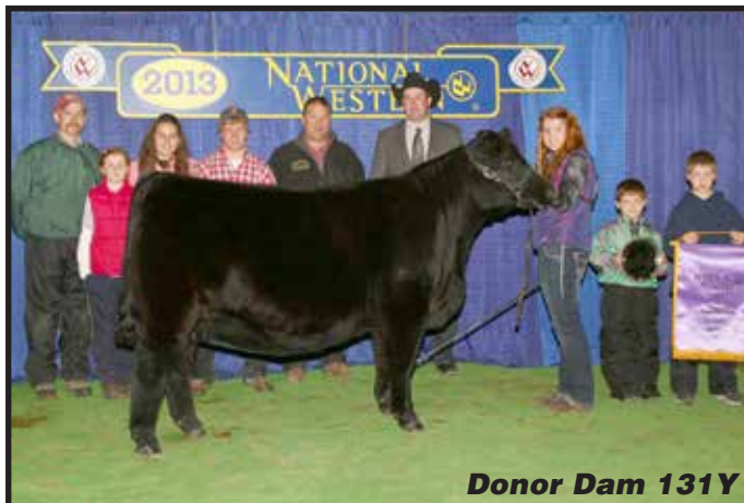
Donor Dam 131Y

TAU 197D- A high growth son of our new herd sire TJB Vickram 342A out of a powerful Contour daughter. 197D is a larger framed bull that offers a ton of length and extension in a sound structured package. He also hit the scales at 710 pounds at weaning.