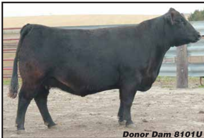
Donor Dam 8101U

TAU 32D- A powerful son of TAU Mr. Grid Topper 43T that has the look of his sire. 32D is backed by a great TAU Top Gun 292Y daughter, and excels in growth and carcass quality. He weaned off the cow at 749 pounds.