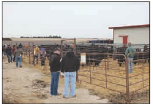
2016 NWSS Reserve Champion Balancer Junior Show