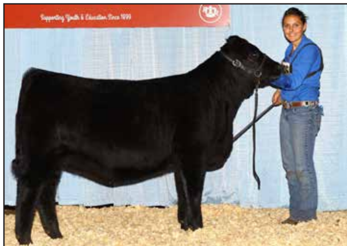
TAU Ms Fancy 414B--Grand Champion Balancer Heifer Calf at the Kansas City American Royal. Grand Champion Balancer Heifer Calf at the 2014 Junior Nationals. Reserve Grand Champion Balancer Heifer Calf at the Iowa State Fair.