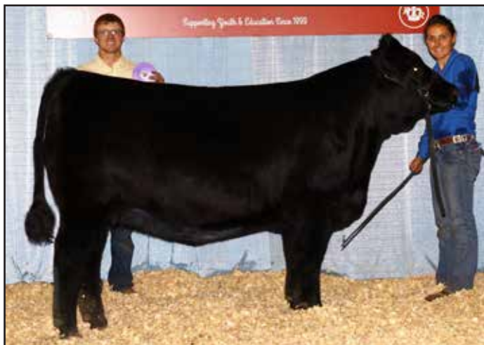
TAU MIA 363A--Reserve Champion Gelbvieh Female at the Kansas City American Royal. Grand Champion Female at the Iowa State Fair.

All bred heifers are AI bred then pasture exposed from 5-23 until 7-11 to TAU Mr Final Answer 259Y Registration #1185210.