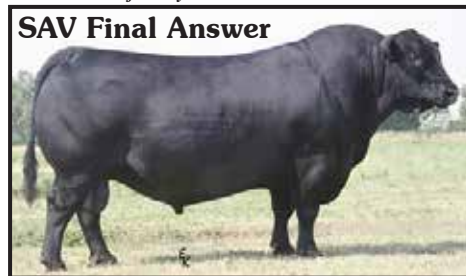
SAV Final Answer

Final Answer is quite likely the most well rounded proven A.I. sire in existence today with his combination of low birth weight, good growth to a year, top 4% RE and unmatched maternal and fertility.