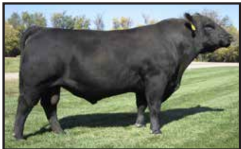
TAU Mr Grid Topper 43T

43T was a member of our 2008 Reserve National Champion Pen of 3 Balancers. He has really been doing the job for us, his progeny are flawless in their structure and balanced in their type, with plenty of rib and muscle. He makes them right.