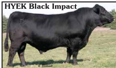
HYEK Black Impact

HYEK Black Impact is a bull that we turned to to make females and add power to our herd, and he most certainly has done that. He makes them functional and we will use him for years to come because of that fact.