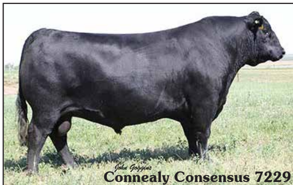
Connealy Consensus 7229

The A.I. sire that has taken the Angus breed by storm. We use Consensus 7229 to add muscle, thickness, and power. Calves are extremely massive and powerful with excellent carcass quality.